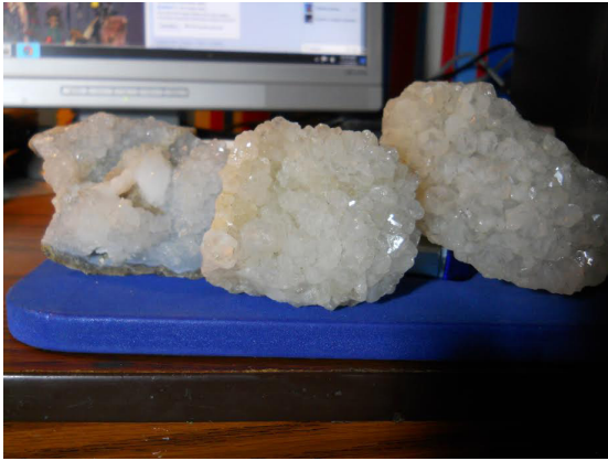
Crystals from a geode