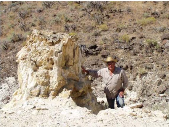
A Couple of Stumps (Marvin)