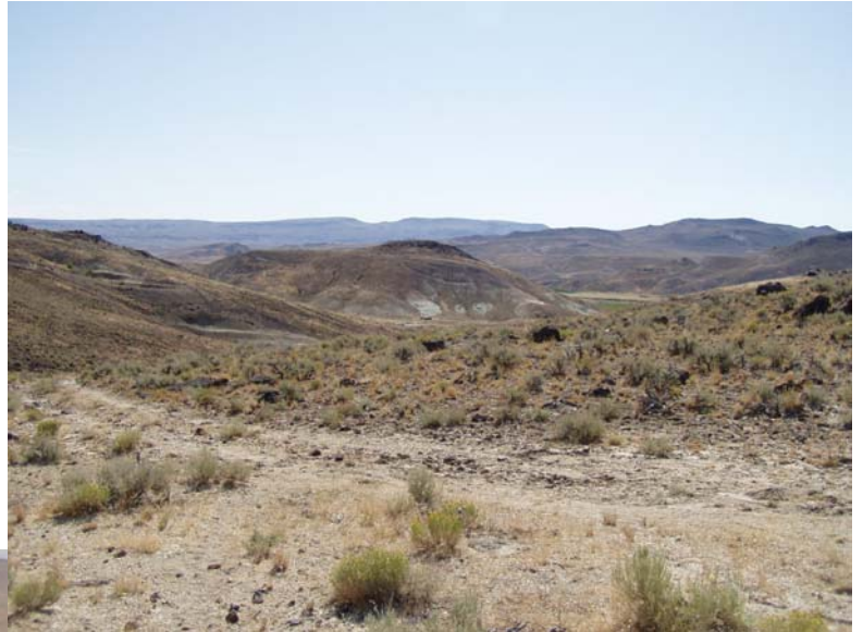
Toilet way way down there!