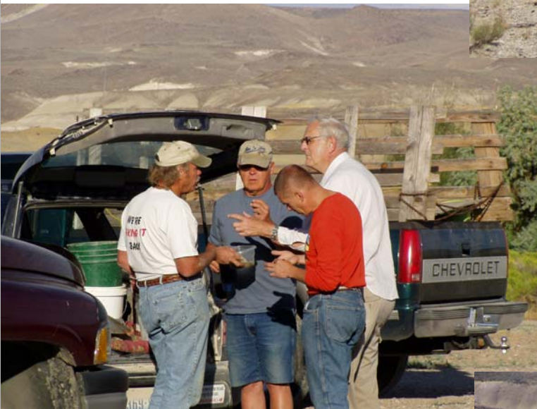
Talking it Over