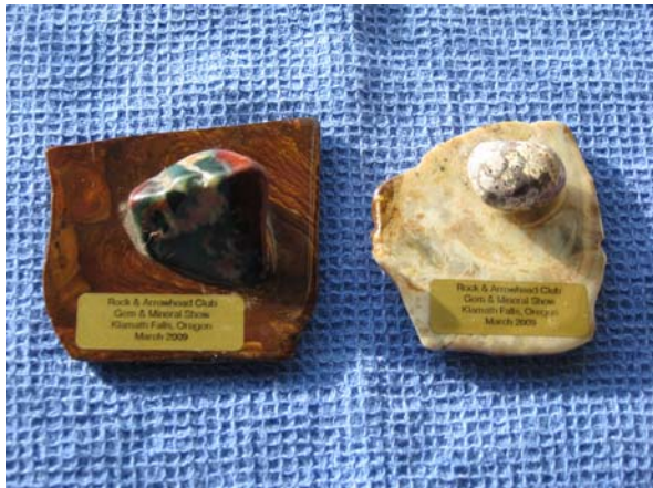
Case Favors 2009