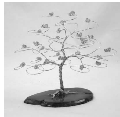
We are learning to make gem trees at our Nov meeting