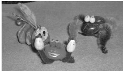
We are learning to make rock critters at our Nov meeting